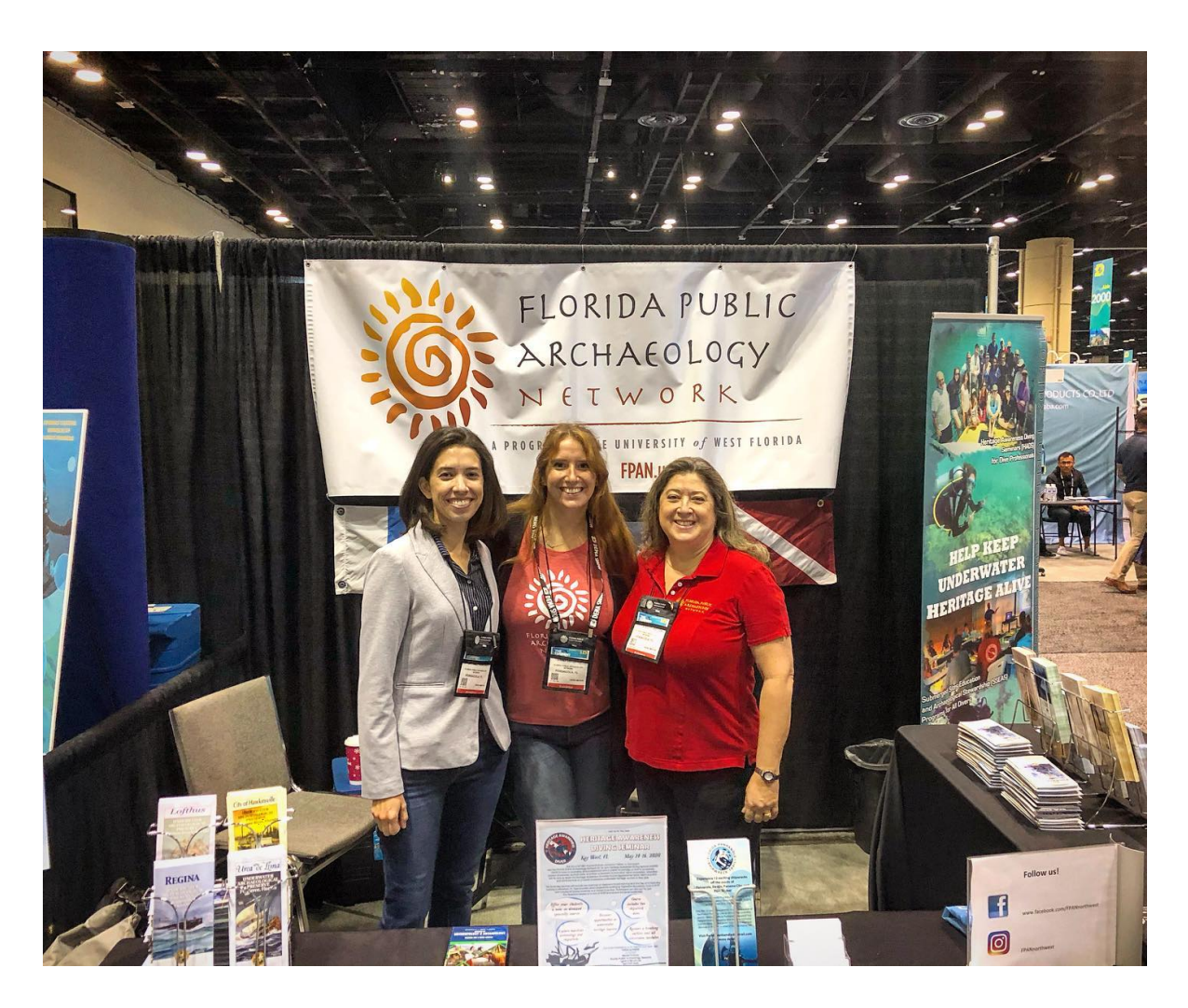
FPAN Staff from the Southwest, East Central, and Northwest offices at the DEMA booth.

The East Central Region Staff attended the Diving Equipment and Marketing Association (DEMA) Show in Orlando to promote Florida's submerged past. FPAN has been exhibiting at DEMA for 18 years, and each year engages with over 1,000 people interested in experiencing Florida's underwater resources. This year we focused on providing materials about Florida's 12 Underwater Archaeological Preserves, our PAST program, and the upcoming HADS training.